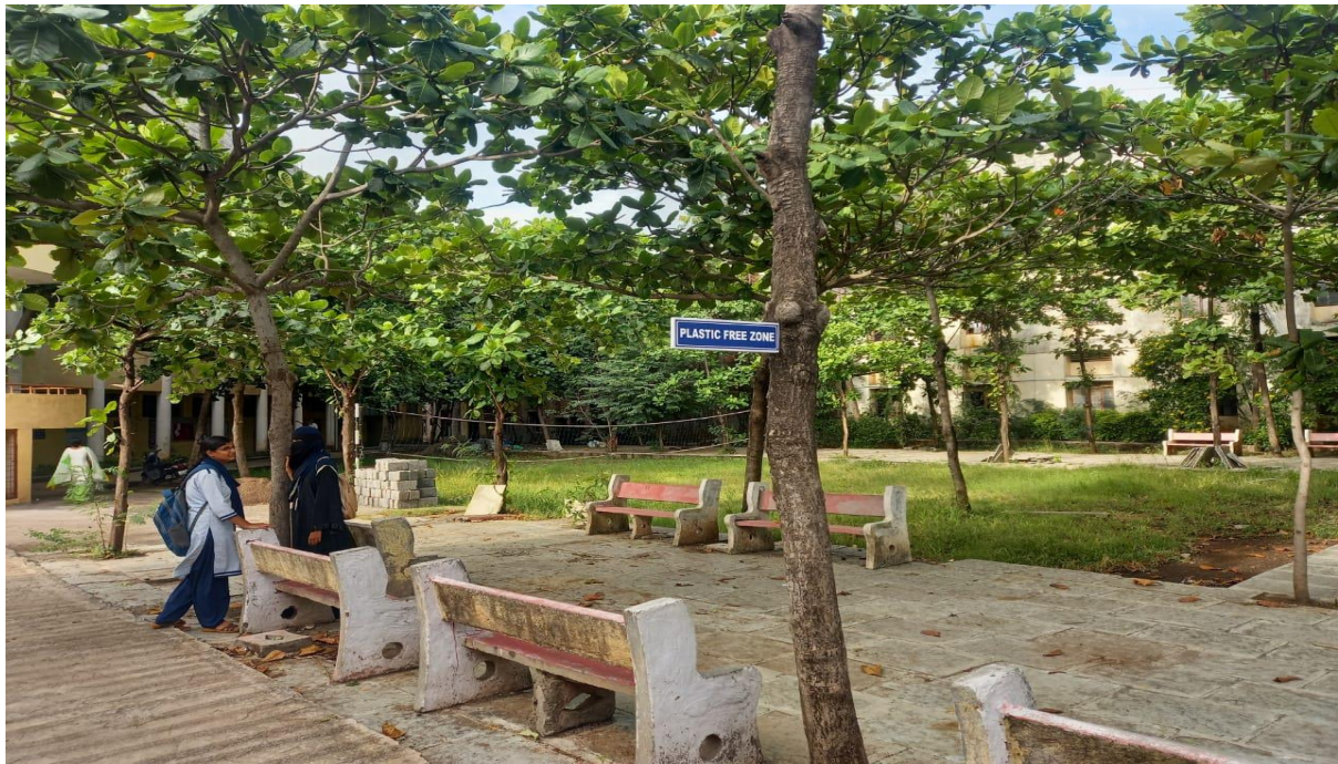
Plastic Free Zone