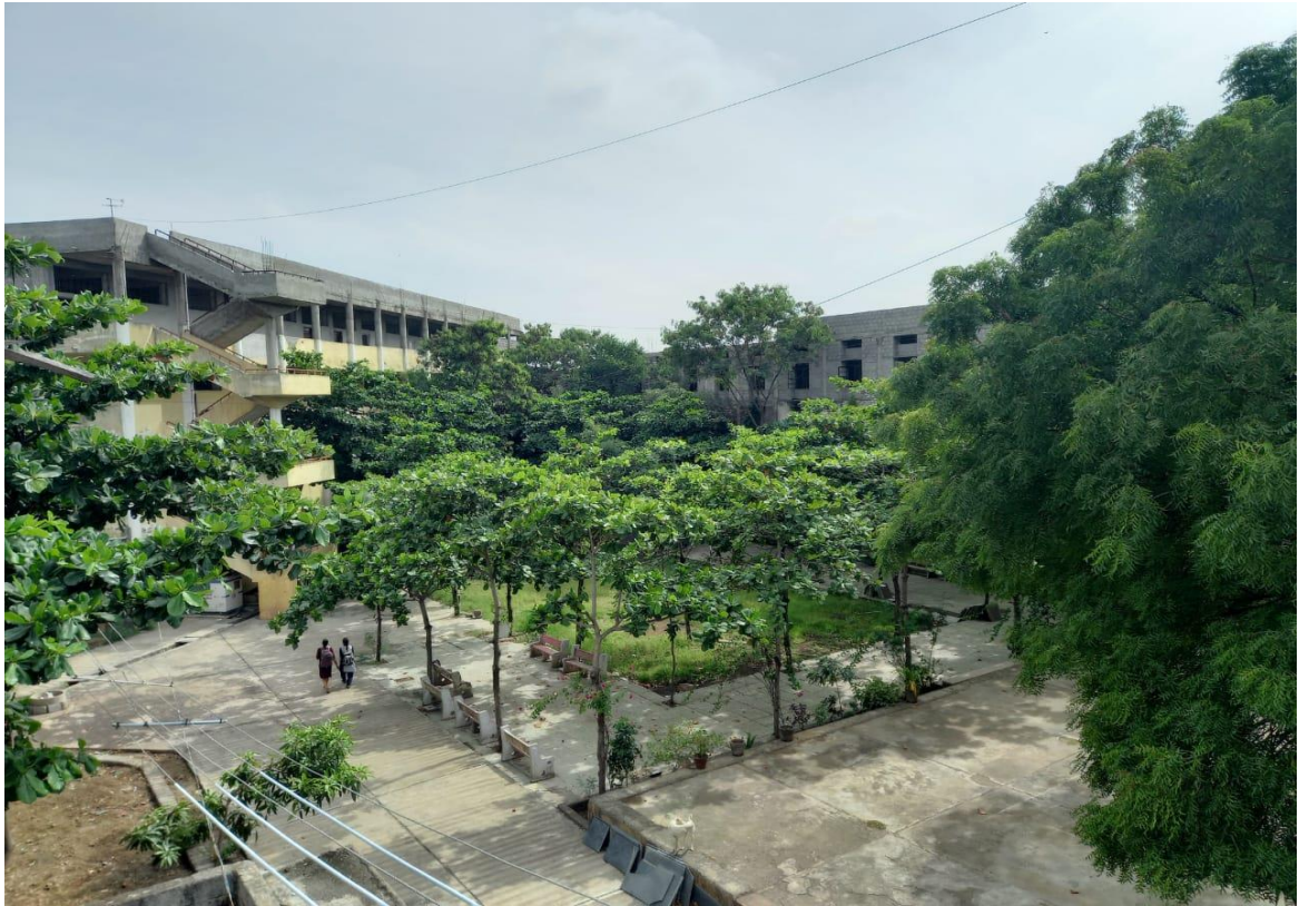
Landscaping with trees and Plants